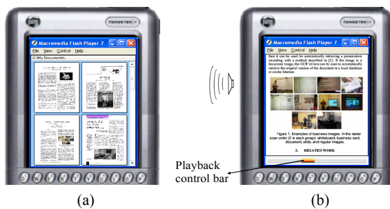
Figure 3. Interface for (a) document browsing and (b) document viewing

The optimization routine outputs an actions file which contains all the information needed by the synthesis step, such as the names of the document images to be included in the MMNail, visual animations to be performed (type, coordinates, and duration), and audible document elements to be synthesized. Visual animations are implemented in Flash using ActionScript 2.0. Speech synthesis is implemented using the AT&T Natural Voices Text-to-Speech SDK. After obtaining visual and audio streams, synchronization is performed using Action Script to obtain a playable MMNail.