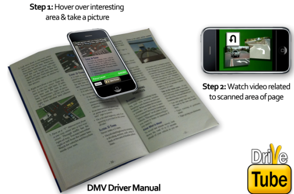
Figure 1. DriveTube: take picture of page; watch related video

of an indexed object can connect users with digital information related to that object.